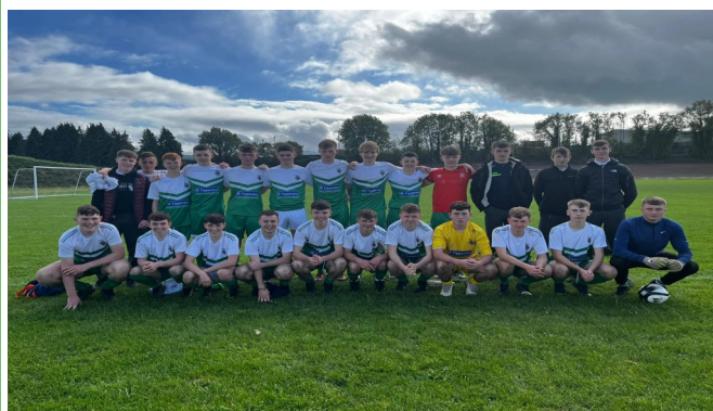
Senior Soccer Panel 2022-2023