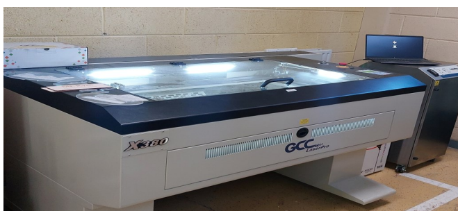
Newly installed laser cutter and engraving machine