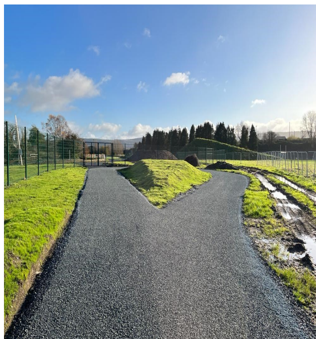
Newly relayed driving track