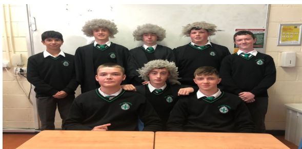
Tys at Law Education Workshop