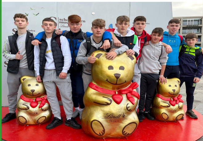
Lindt Germany Chocolate Museum

We woke up excited for our final day. Shortly after our breakfast, we walked along the banks of the Rhine to the Lindt Chocolate Museum for a tour. In the afternoon we visited the famous Cologne Cathedral and did some shopping. We departed Frankfurt airport for a late flight back to Ireland.