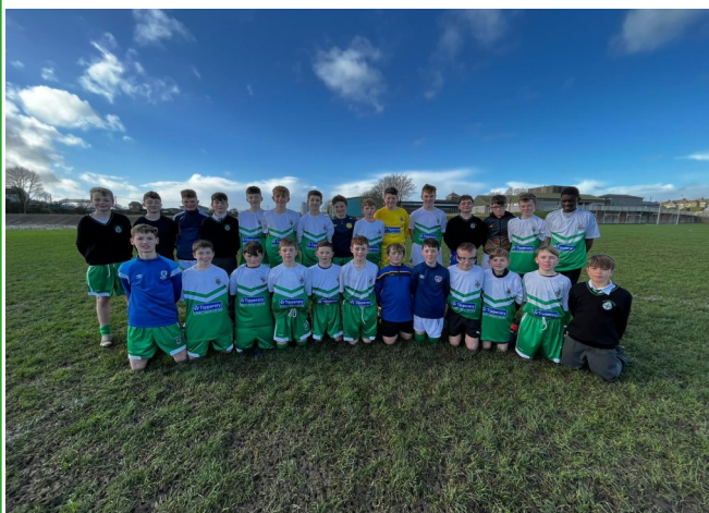
First Year Soccer 2022-2023