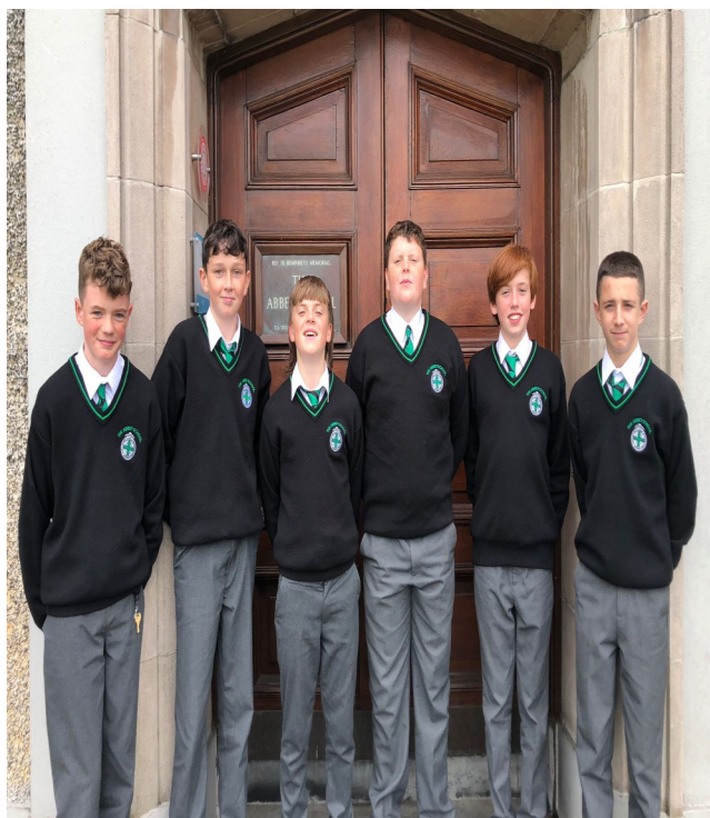
First Year Student Leaders