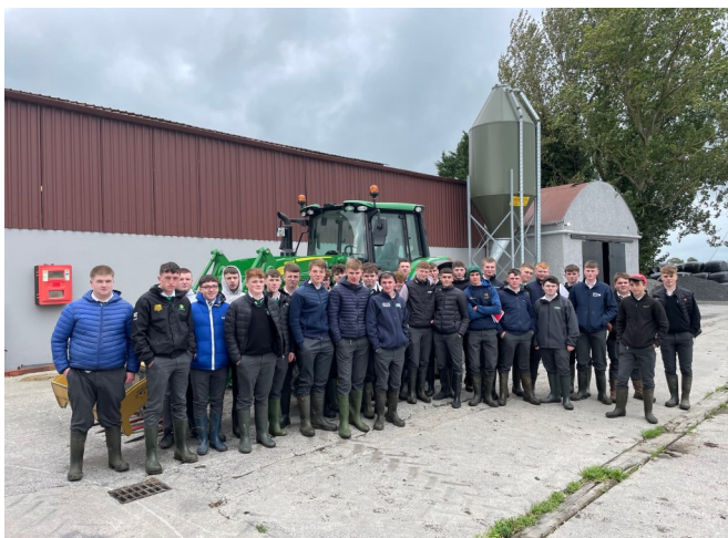
5th &amp; 6th students at Solohead Research Farm

On Thursday October 6th, fifth and sixth year Agricultural Science students visited Solohead Research Farm which is just outside Tipperary Town. The students had a very insightful morning with Teagasc researchers working on the farm.