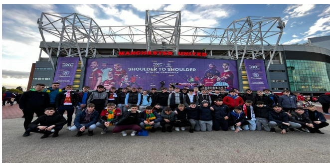
Abbey boys at Old Trafford

On Wednesday October 19th, 3rd Year students and some students from 5th Year headed off on an adventure packed trip to Manchester. They visited Old Trafford, The National Football Museum and Alton Towers. The highlight of the trip was getting to watch United beat Spurs at Old Trafford