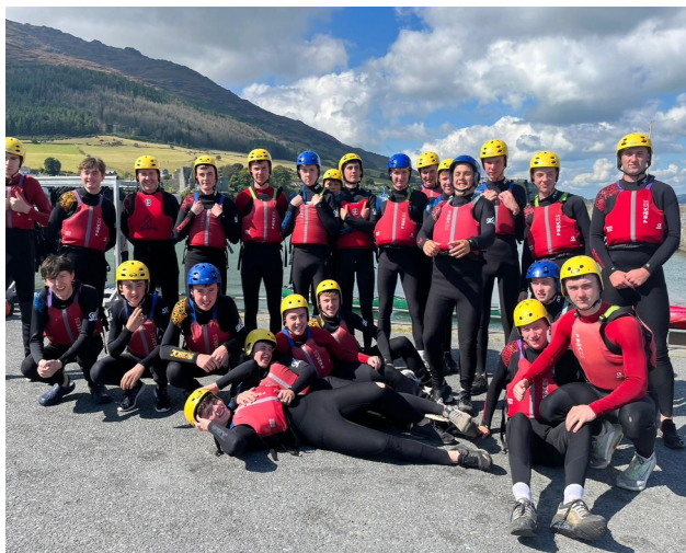
Kayaking at Carlingford Adventure Centre