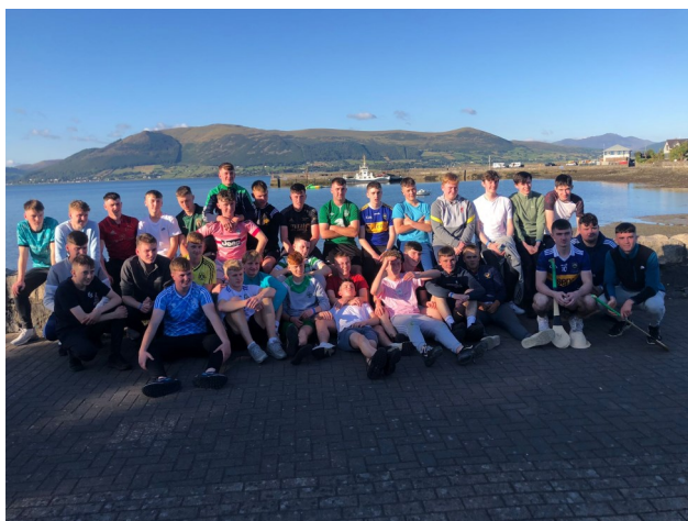
6th Year students at Carlingford Adventure Centre