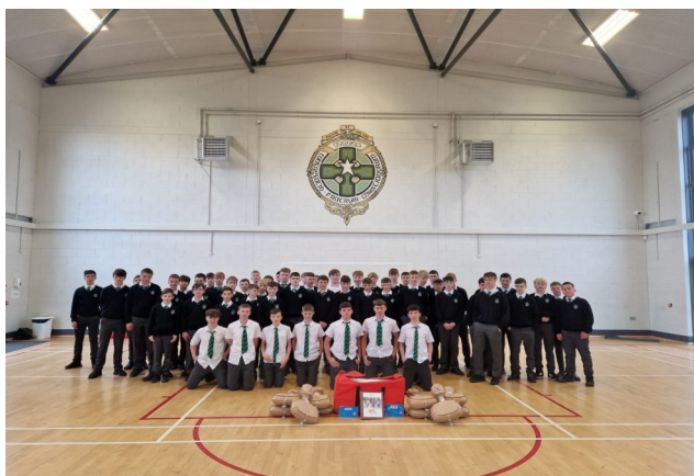
"CPR4Schools" with 2nd and 3rd Year Students

Our Second and Third Years were provided with CPR training as part of the Irish Heart Foundations, "CPR4Schools" initiative. The boys were trained in the basics of compression only CPR, the use of a defibrillator and basic first aid in the event of an emergency. These boys will also now act as facilitators as they will help roll out the programme to our first year students.