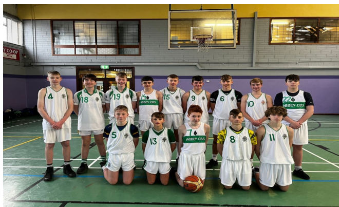
U16 Basketball Panel 2022-2023