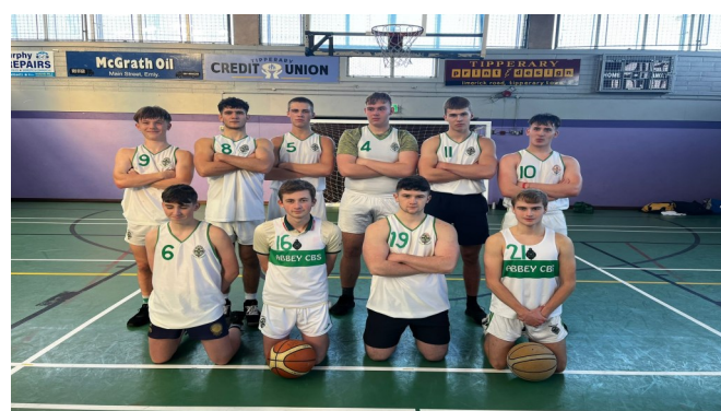
U19 Basketball Panels 2022-2023