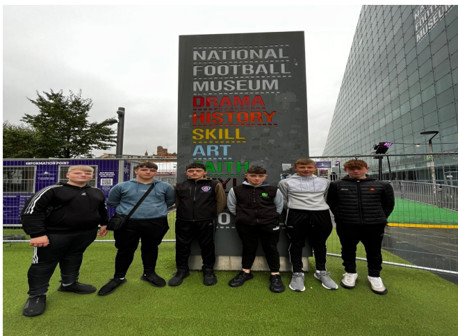
Third Year students at National Football Museum