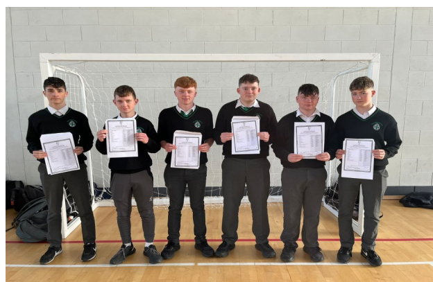
Junior Certificate Class 2022