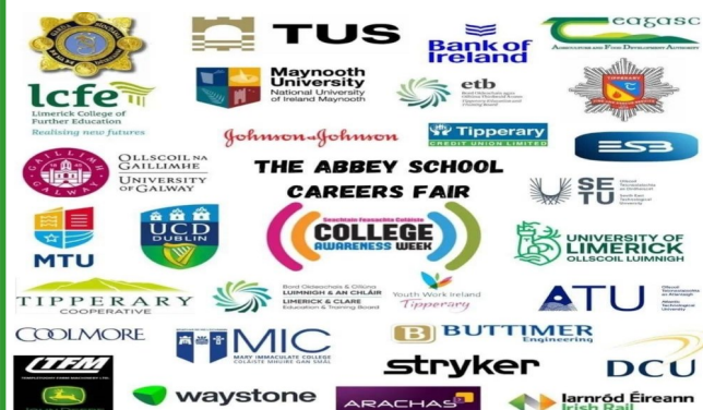
Careers Fair Companies

Our final event took place on Thursday December 01 st . Our annual College and Careers Fair was held on site in the PE Hall for the first time since January 2020. It was attended by almost forty companies and colleges with all career sectors represented. Many past students returned to offer their advice to our current students on their respective college courses and career paths to date. We were delighted to welcome students from our neighbouring schools, St. Anne's and St. Ailbe's to the event also. Thanks to all who were involved in the activities that made this campaign the success that it was.