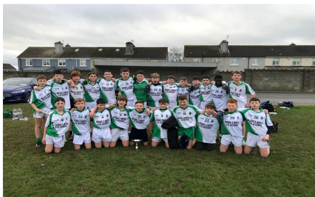
First Year Football Panel 2022-2023

Well done to our First Year footballers who competed in an All county football blitz. The blitz took place in Dr Morris Park in Thurles. The Abbey faced Clonmel High School and were narrowly beaten. Both sides showing some great skill. The Abbey beat Cashel Community School in the final of this competition to become county champions.