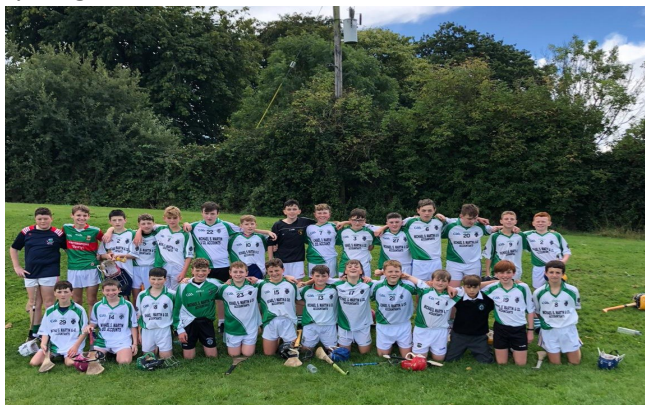
First Year Hurling Panel 2022-2023