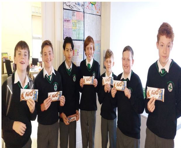
Maths Week Mind map Winners

First Year students participated in a mind map competition in Maths. They worked on study skills as a visual aid to remember key point from the topic, Sets.