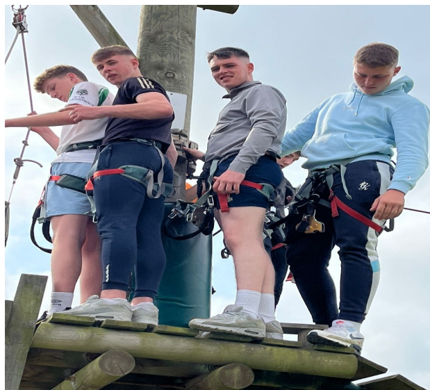
Getting ready for ziplining at Carlingford Adventure

On August 31st our 6th Year students set off on a team building adventure trip to Carlingford Adventure Centre for two days. They also visited Tayto Park in Co. Meath enroute to carry out an Ecology field study. This particular group of students participated in TY during the 2020-2021 school year and never left the county until their final day in May 2021 when they cycled the Waterford Greenway. The trip to Carlingford somewhat compensated for missed opportunities during TY. It also gave the boys an opportunity very early in the current school year to work together outside of the school setting. They returned focused and working hard towards achieving their goals at the end of the year.