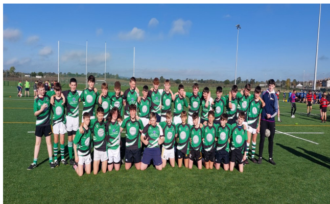
U15 Rugby Panel 2022-2023

Our U15 rugby team have had two enjoyable days of rugby playing in the East Muster blitz. These blitz days will continue in the New Year, with a final day scheduled for Thomond Park. The boys will also kick off their Cleary Cup campaign with their first match away to Villers in early February.