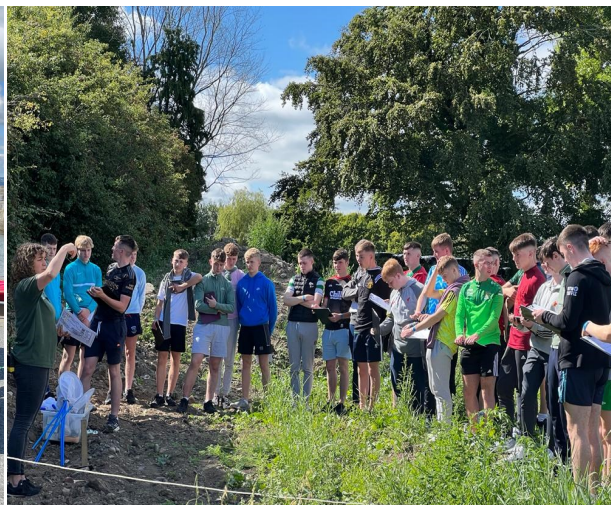
6th Year Ecology Trip at Tayto Park