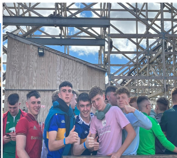
Cú Chulainn time at Tayto Park