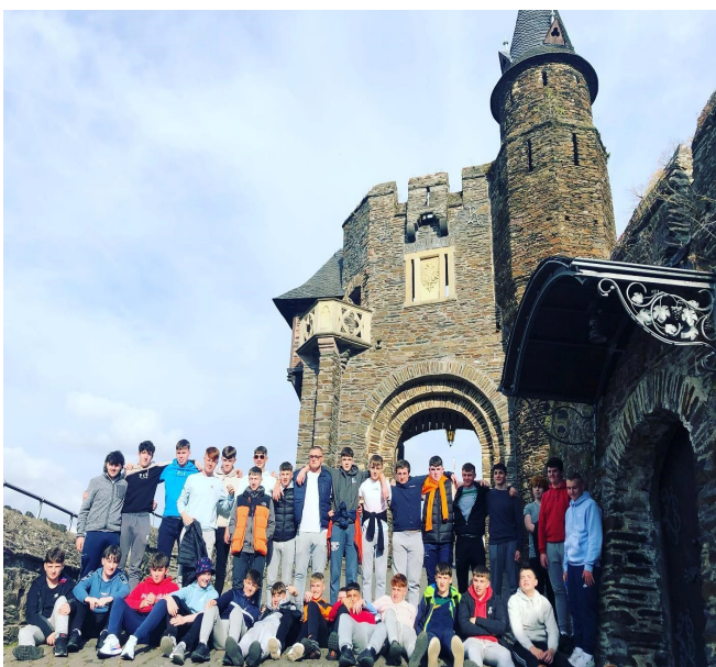
TY students at Cochem Castle

Cochem Castle or Reichsburg, which means imperial castle, is located at River Moselle. The medieval castle towers over the Moselle River valley and is one of the most picture perfect of all the castles in Germany. We spent two nights at our hotel in Boppard.