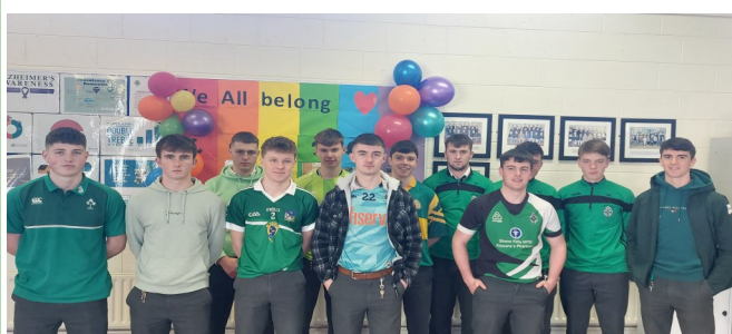
Colours Day at The Abbey School