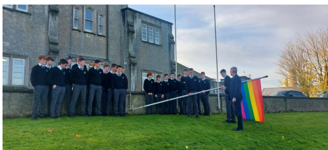
Pride Flag Ceremony