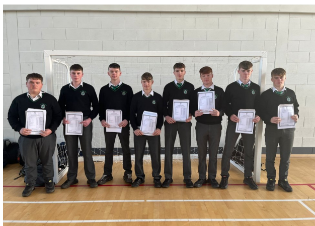
Junior Certificate Class 2022

Five months after sitting their exams, Junior Certificate students of 2022 finally received their results on 23rd November. These were the first Junior Cycle results since 2019 because of the pandemic and it was the first year in which all the examinations were delivered under the reformed Junior Cycle curriculum. Huge congratulations to all the boys on their results.