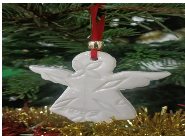
Christmas Decorations created by Arts & Craft Club